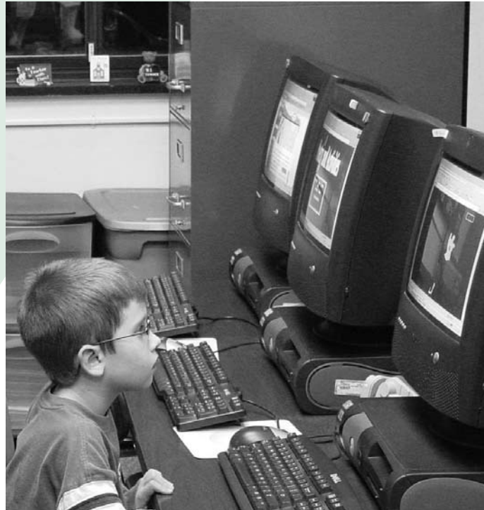
Pioneer School District uses Internet filtering software to block social networking and instant messaging web sites on all computers.

Online predators use a simple “grooming process” to lure their victims, which begins with having shared similar interests to discuss. After gaining their victims’